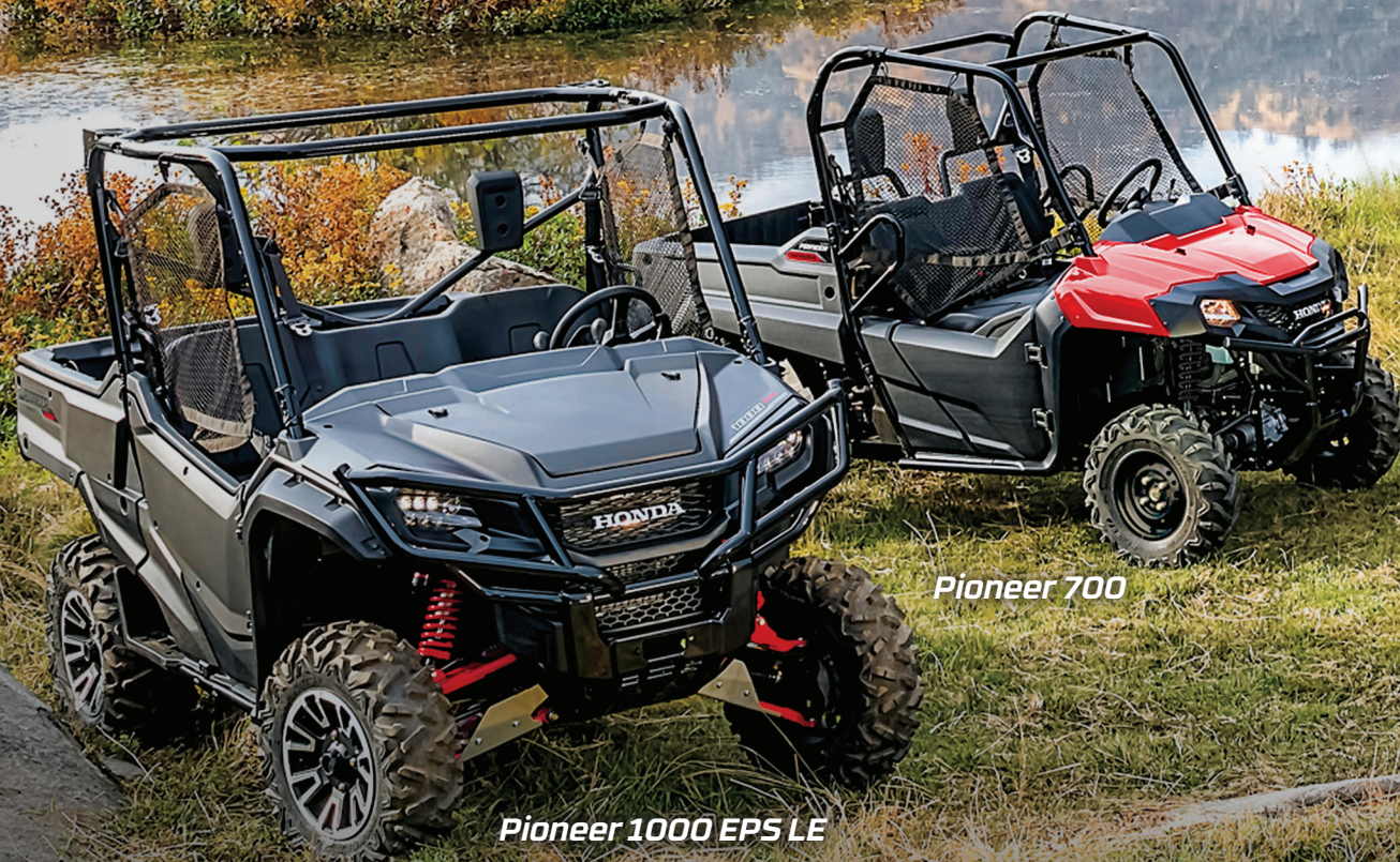
Pioneer 1000 EPS LE

The Honda Pioneer side-by-side lineup offers adventure in every shape and size—absolutely trusted to take you just about anywhere and back with legendary off-road capability and industry-leading innovation on your side. After all, it's your life, Honda side-by-side just makes it more fun!