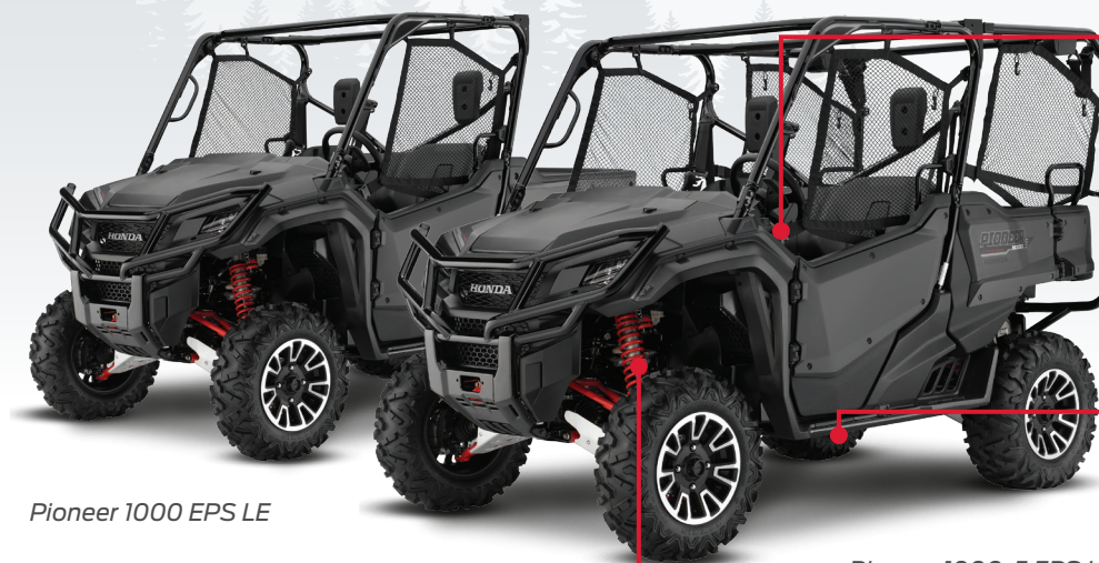
Pioneer 1000 EPS LE

The Pioneer 1000 EPS LE and 1000-5 EPS LE (Limited Edition) models offer premium performance and features including quick-adjust Fox QS-3 sport suspension with red-painted components, an aluminum skid plate, aluminum wheels, front bumper guard with painted body panels and exclusive limited edition graphics. You'll also find clever under seat and under dash additional storage with handy front and rear cup holders and comfortable seating. Designed for rugged outdoor adventures and making quick work of tough tasks, each Pioneer 1000 model is engineered to deliver the ultimate side-by-side experience.