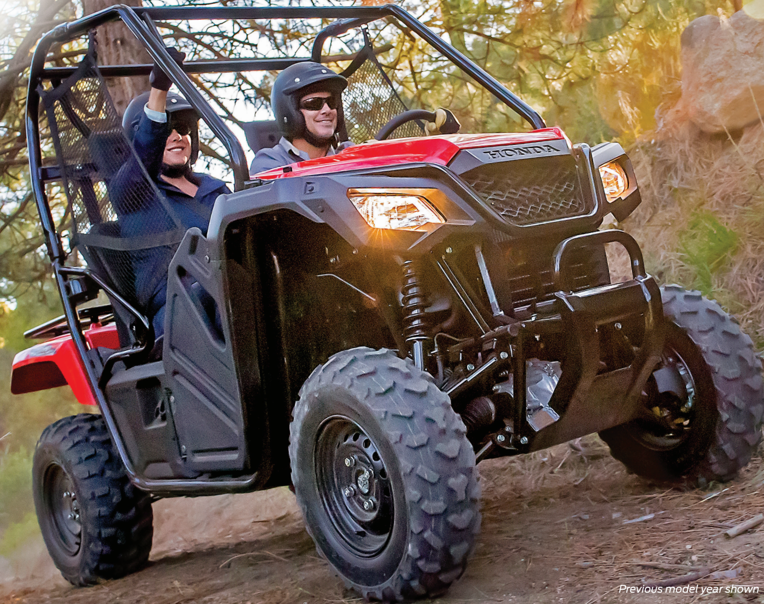
Previous model year shown