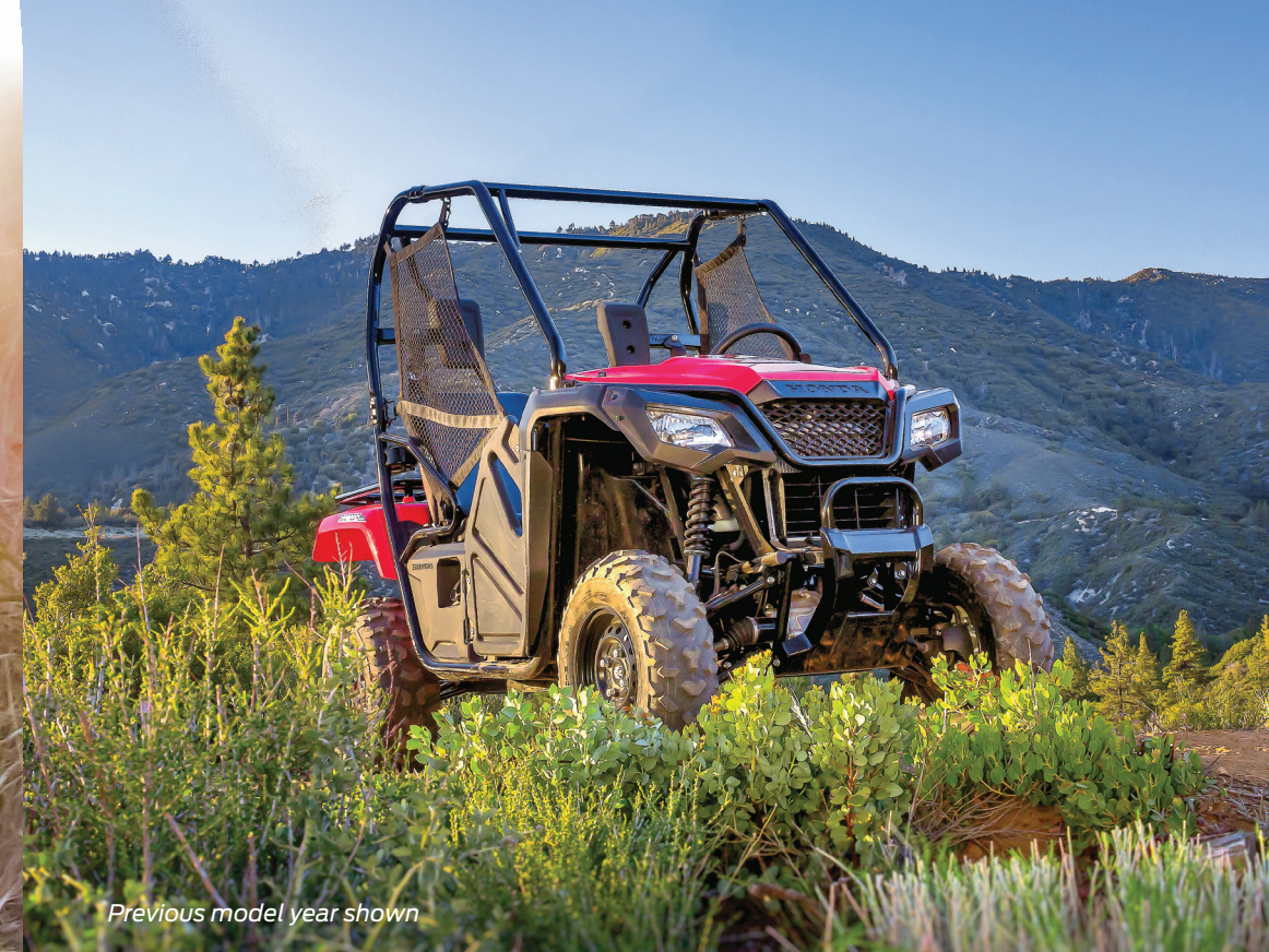
Previous model year shown