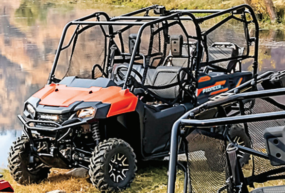
Pioneer 700-4 DELUXE

Adventure is everywhere with the mid-sized Pioneer 700, ruggedly built for fun at every turn and exploring the great outdoors. Powered by a liquid cooled 675 cc Honda engine, the Pioneer 700 comes in your choice of room for two passengers with its handy tilt cargo box or QuickFlip™ individual folding in-bed passenger seats for up to four people.