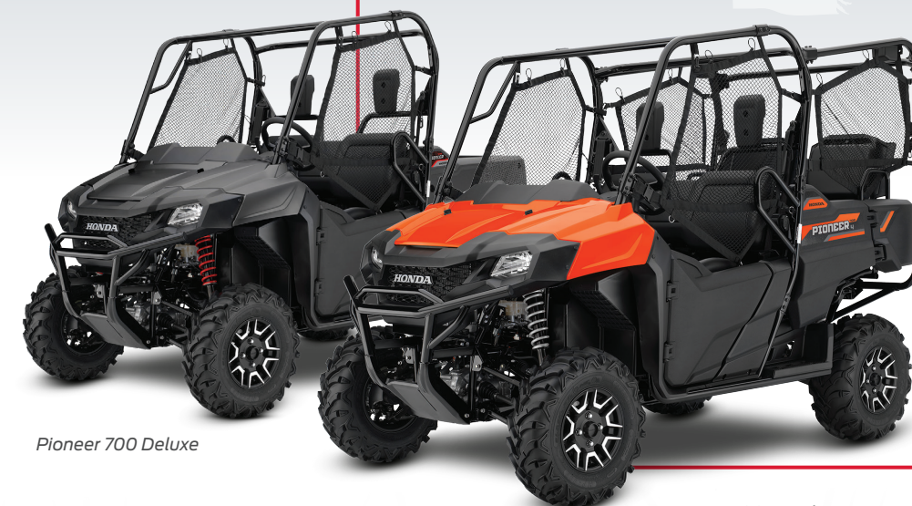
Pioneer 700 Deluxe

Deluxe models boast stylish aluminum wheels that look great while helping reduce unsprung weight for improved handling and ride comfort. Painted bodywork, sporty suspension springs and front bumper add to its rugged and recognizable off-road design.