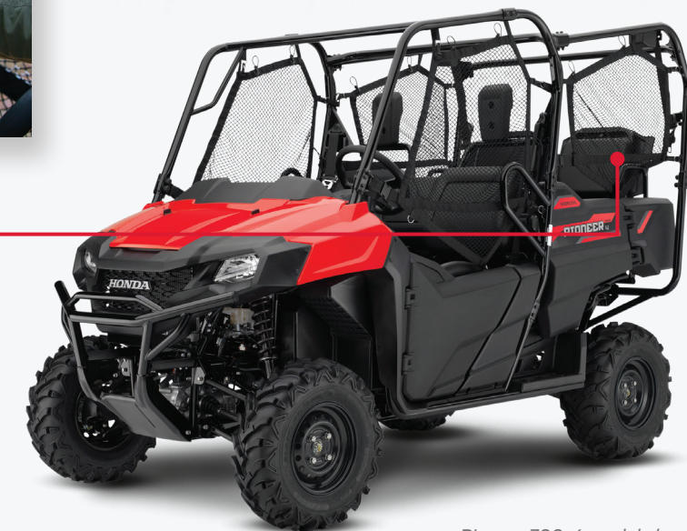
Pioneer 700-4 model shown

The sturdy Occupant Protection Structure, standard doors with an automotive-style double latching system, roll-up side nets, and three-point belts, all help keep you and your passengers safe and secure.