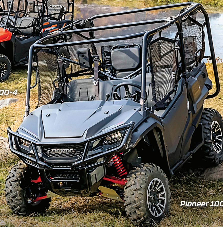
Pioneer 1000-5 EPS LE